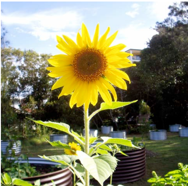
Left: Sunflowers attract bees to the vegetable patch