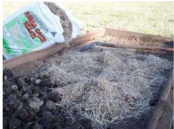
Sugar cane mulch is excellent for mulching around small vegetable seedlings