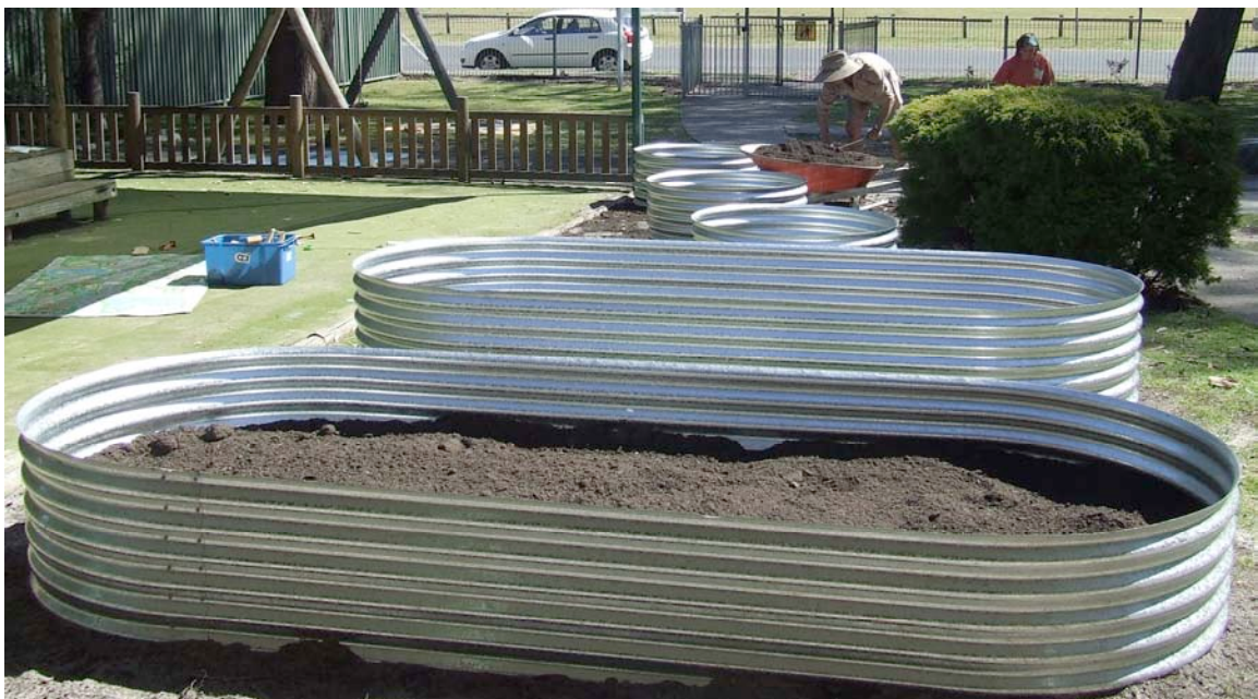
Corrugated iron water tanks make an easy to install garden bed edge