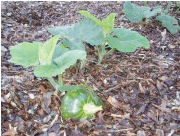
A pumpkin vine mulched with a coarse wood chip

To conserve water and keep the weeds at a minimum level, mulching is a must! The best type of mulch for a vegetable garden is certified organic sugar cane mulch, which is finely chopped up mulch and great for mulching around seedlings. It is readily available from nurseries and hardware stores. Mulching can be done before or after you have planted seedlings, although it is often easier to mulch first and then make a hole and plant the seedling into the soil. Leave a 2cm gap around the seedling free of mulch so the seedling stem doesn't become too wet and rot.