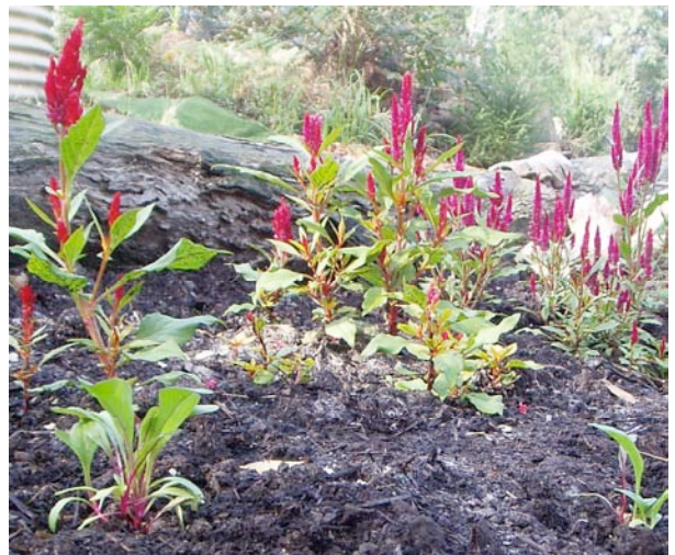
Above: Celosia planted as a border in the vegetable patch