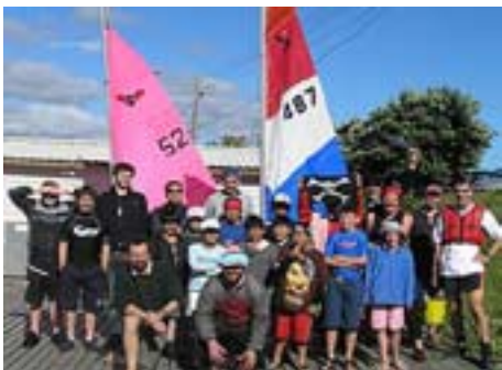
The keen sailors at Titahi Bay, Wellington.

Two Unitec built hulls have been purchased by Titahi Bay Sailing Club. The boats will be used mostly by local kids but anyone can have a sail - the more, the merrier. Any other 'Bugs in the area are also welcome! Contact Hugh: 021 396 417.