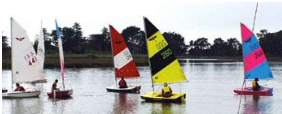
Cold and grey conditions at the Pleasant Point Yacht Club in Christchurch for the Closing Day races.