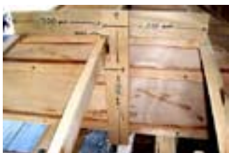
The tee square works from the centreline.