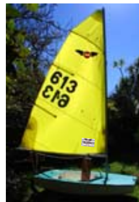
Sails will now carry a 'BugBits label.

'Bug sails are being made by a new sailmaker and will carry the 'BugBits label. All is high quality, still made in NZ and with a full range of colour options. The cut has been fine tuned again.