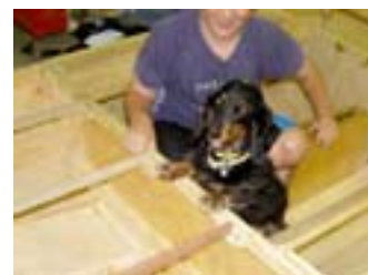
"A trusty helper and salty old sea dog".