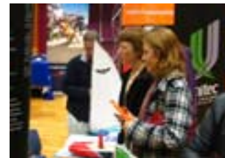
Scale model 'Bug at Glenfield College.

Planpacks, kits, sails etc can now be paid for by credit card or PayPal account on the FireBug website.